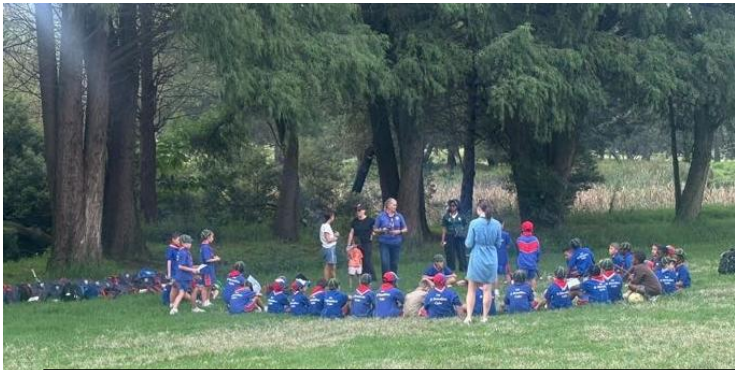
Nature Ramble & Easter Egg Hunt