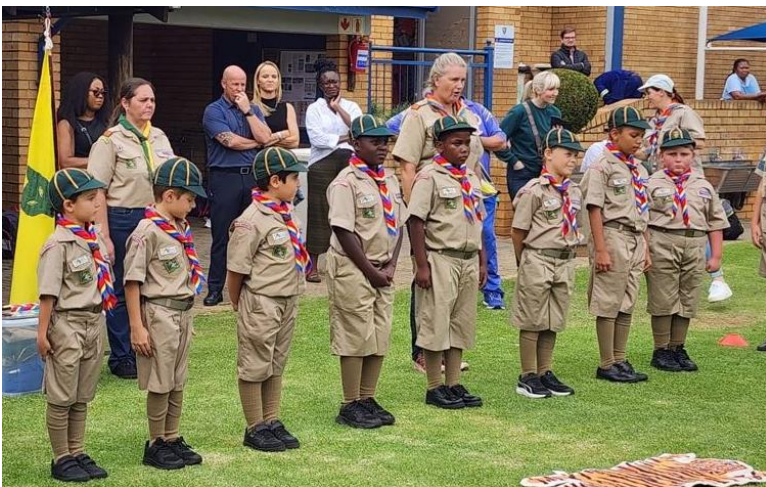
BP Sunday Celebrations