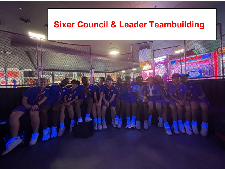
Sixer Council & Leader Teambuilding