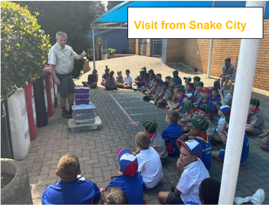
Visit from Snake City