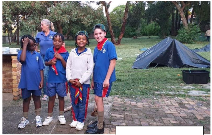
Outdoorsman Camp 2026

On the 2 April Our Sixers and Seconds enjoyed a Sixer Council meeting with Team building Ten Pin Bowling and Milkshakes to end the term